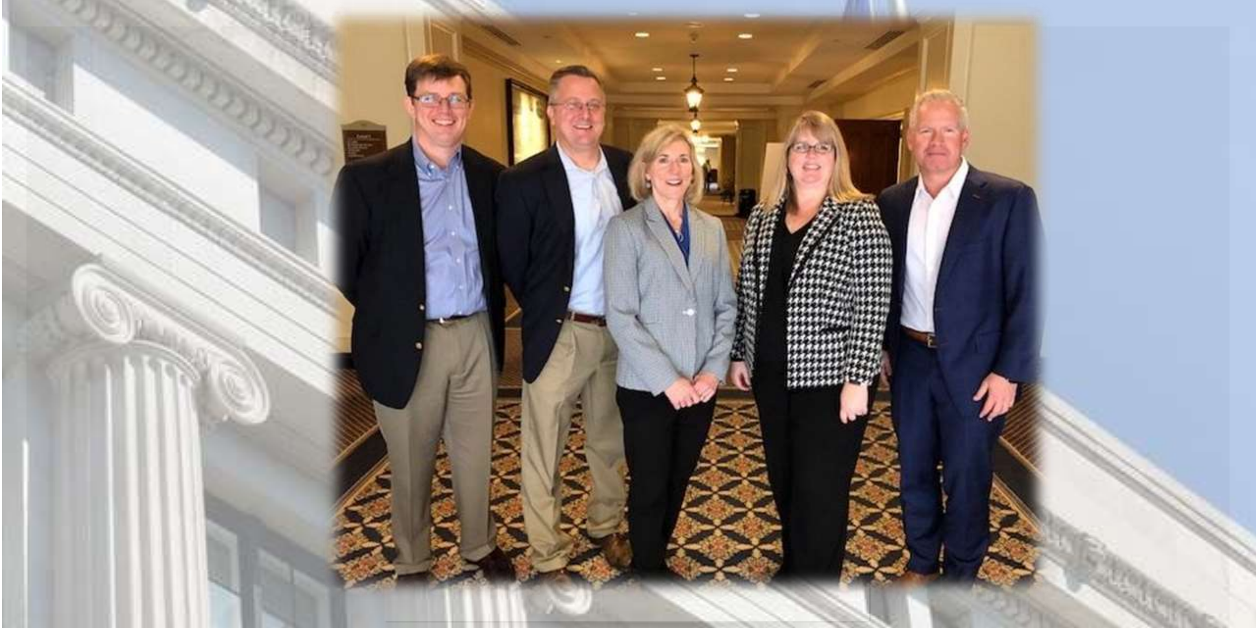
2019-20 Executive Committee